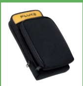
C781 Soft Meter Case