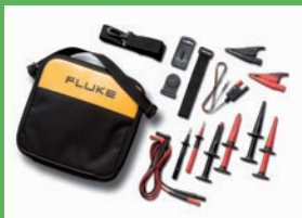
TLK289 Electronic Test Lead Kit